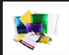
Poly Bags, Mailers & PLEs