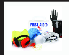
Safety & Gloves