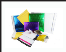
Poly Bags, Mailers & PLEs