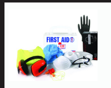
Safety & Gloves