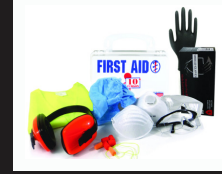
Safety & Gloves