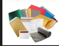
Poly Bags, Mailers & PLEs